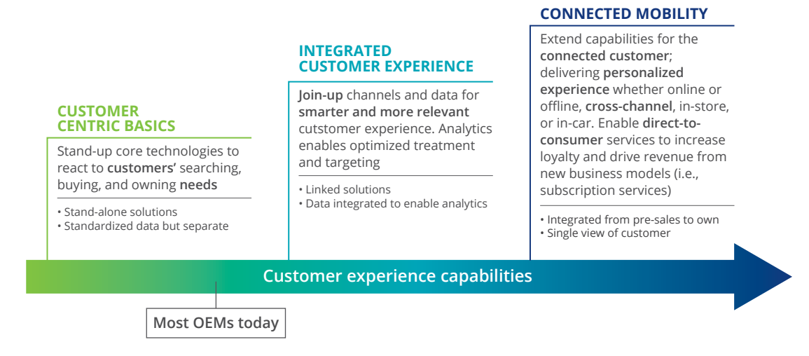
Figure 4. OEMs and dealers need to invest aggressively in customer-centric capabilities and data to be ready to deliver connected mobility